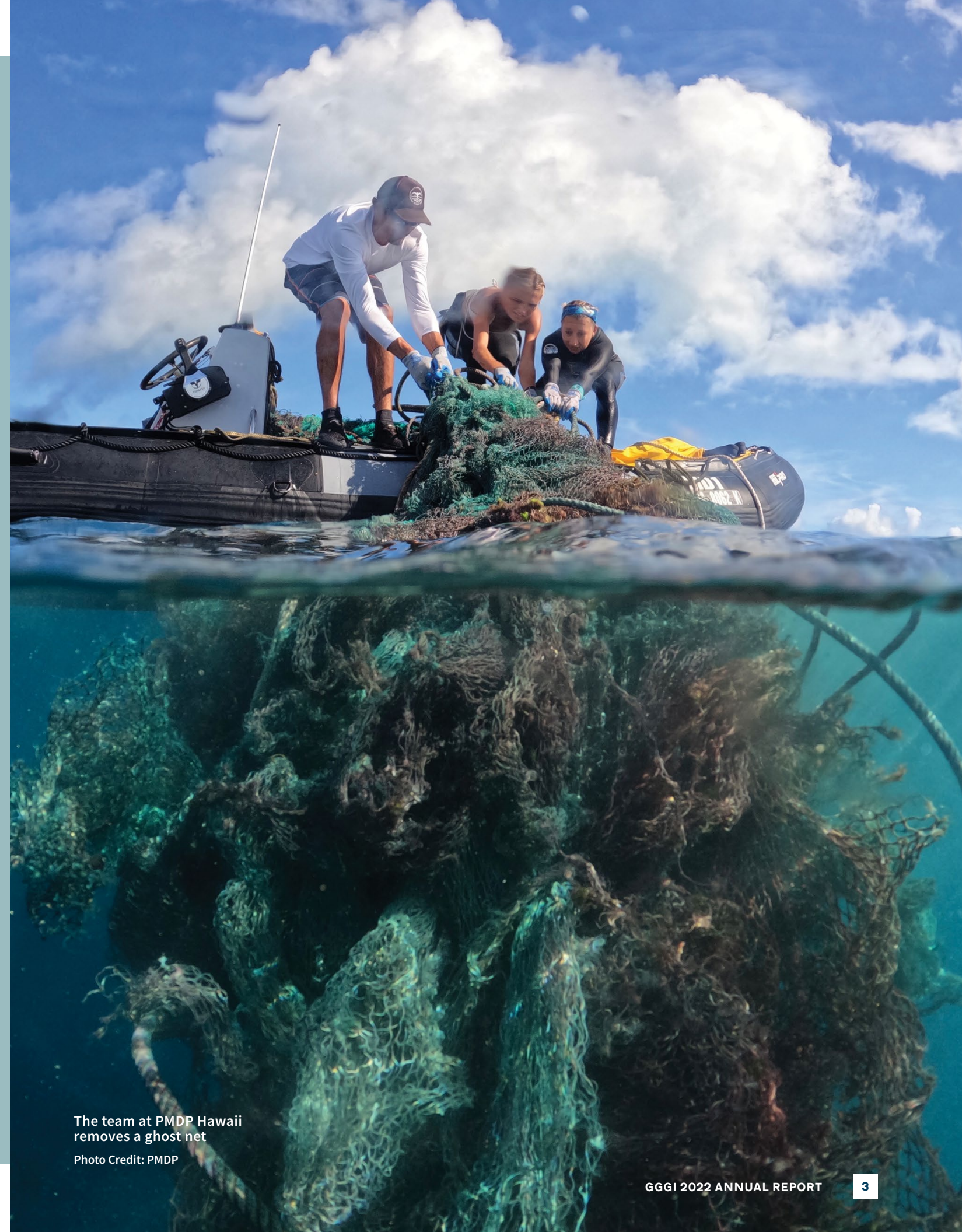
The team at PMDP Hawaii removes a ghost net